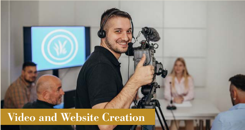
Video and Website Creation