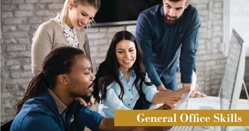
General Office Skills